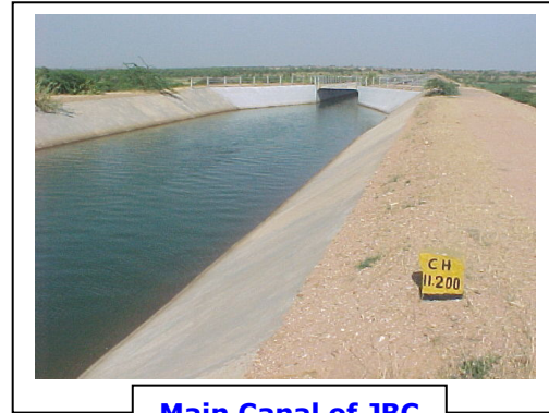
Main Canal of JBC