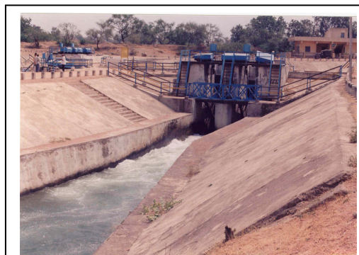
MBC at Off-take