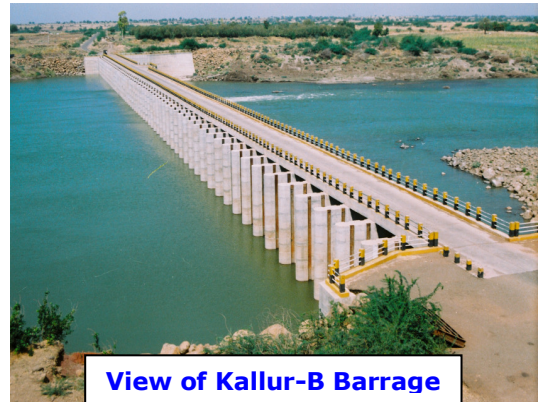
View of Kallur-B Barrage