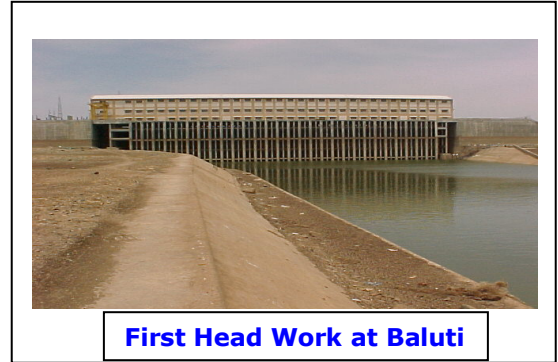
First Head Work at Baluti